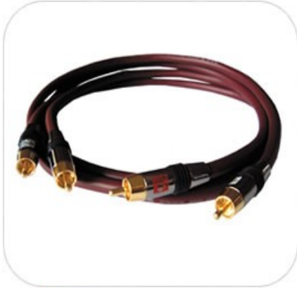
JASC-02 Double Core Signal Cable

The JASC-02 is JungSon's most cost effective interconnect that contains two individual shielded conductors made from oxygen-free-pure-copper with a 5N (99.999%) purity. Each conductor contains a precisely-organized array of 120 fine OFPC strands wound around a centre thicker OFPC core and polypropylene dielectric. As a result, the cable can faithfully transmit bass and treble energy, and remarkably reject a wider range of noise. High silver content solder and proprietary soldering techniques at all stages of assembly help maintain superior sound quality. JASC-02 is available in high quality XLR (balanced) or RCA (unbalanced) plugs.