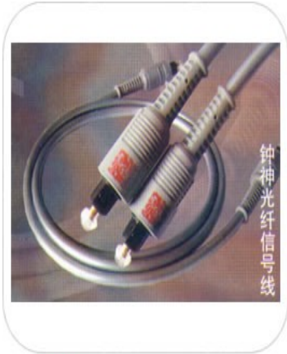
JFIC-06 Optical Signal Cable