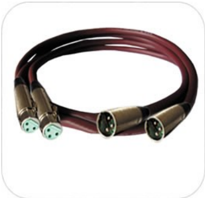
JASC-02 Fitted with Balanced Terminals