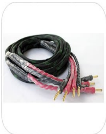
Beauty Deity Speaker Cable

Products > Cables > Beauty Deity Cables > Speaker Cable