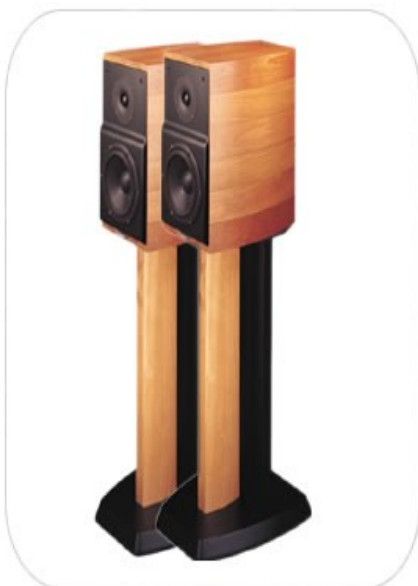
BD No 2 Bookshelf Loud Speakers